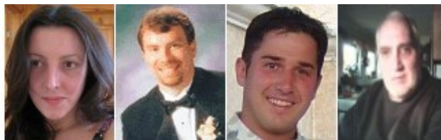
Niche Power Group